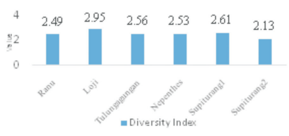
Fig 2. The diversity index of each transect

transect, Ranu transect was lowest (0.42) and Tulungagungan transect was highest (0.88) (Fig 3).