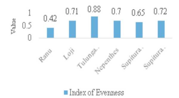
Fig 3. Index evenness of each transect

A comparison will have full similarity if index of similarity value equals one. There were different values of index similarity due to different habitat types in each transect, other than that bird cruising rate and adaptability influence to birds encounter in each transect (Soendjoto et al. , 2015; Adelina et al. , 2016; Wulandari and Kuntjoro, 2019).